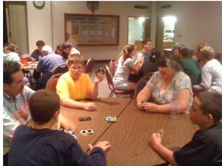
Family Games Night at the Church