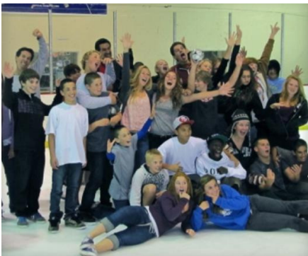
Broomball on the Ice with the First Pres. Youth Group