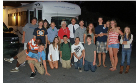
Ordination and Pizza with First Pres. Youth Group