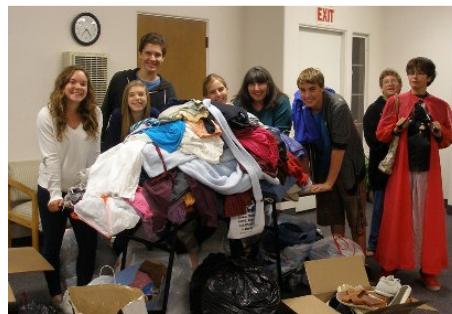
Clean the Closets for Charity