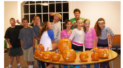
Halloween Costume Party & Pumpkin Carving